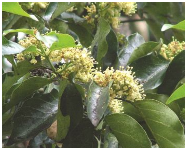
Fig. 1: Canthium dicoecum leaves.

The anticancer activity was determined by MTT assay (Mossman T., 1983). The ethanol extracts of the plant Canthium dicoecum leaves were found to have maximum anticancer activity.. Ethanol extract result presented in table 1 and Fig. 3 revealed that the isolated compound have IC 50 values lesser than that of positive