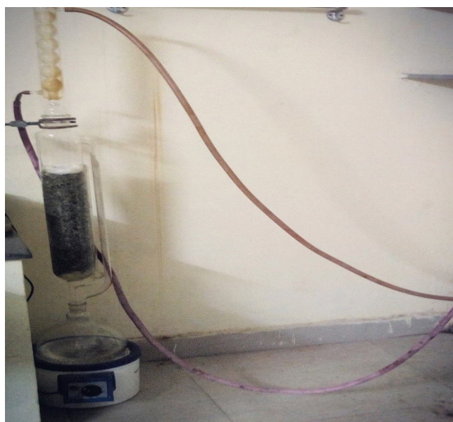
Fig. 2: Overall view of extraction using Soxhlet apparatus.